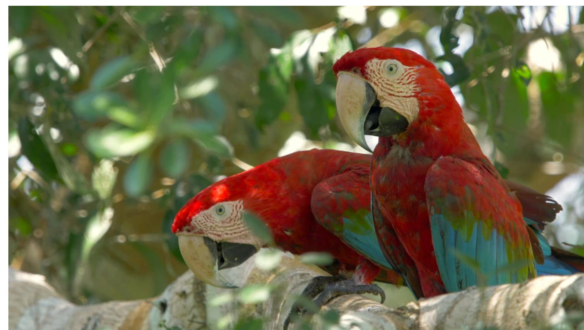
Feathers from the red-and-green macaw, native to the Amazon rainforest, have been found hundreds of kilometres away at the ancient site of Pachamac.

Feather-fancying ancient Peruvians imported live parrots from the other side of the Andes mountain range, hundreds of kilometres away 1 .